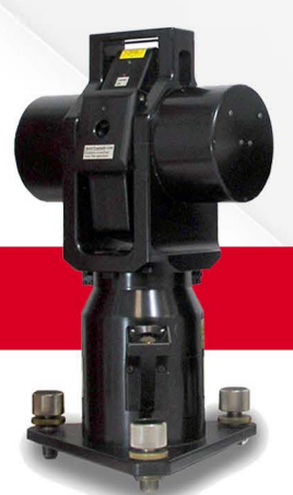
TRACKER 2 1999

RADIAN 6D trackers can be enhanced with calibration tools to perform dynamic calibration and tracking of industrial robots and machine tools providing enhanced performance of manufacturing processes by reducing process variation.